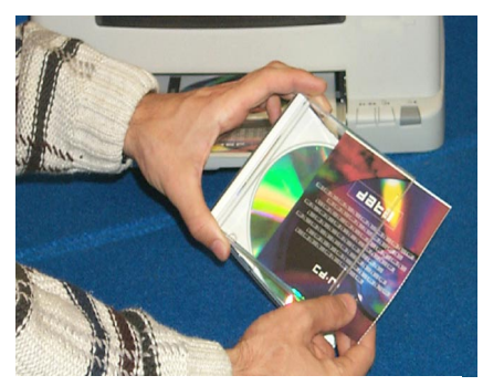
4) Place the front panel insert into the CD jewel case.