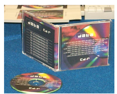
8) Presto! Your jewel case and CD are complete.