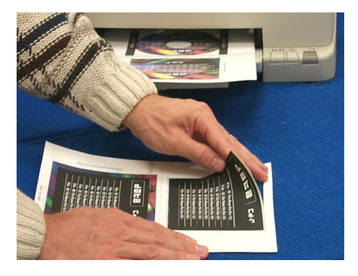
3) Carefully fold back and fourth along perforations to remove the front panel insert.