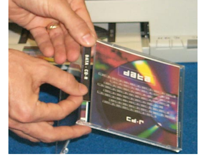
6) Remove the optional spine labels from the CD Label/Jewel Case form at this time. Adhere the spine labels to the ends of the jewel case.