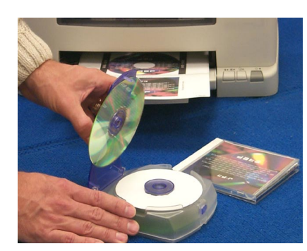
5) Remove the CD label from the CD Label/Jewel case form. Use a standard CD label applicator to properly adhere label to CD.